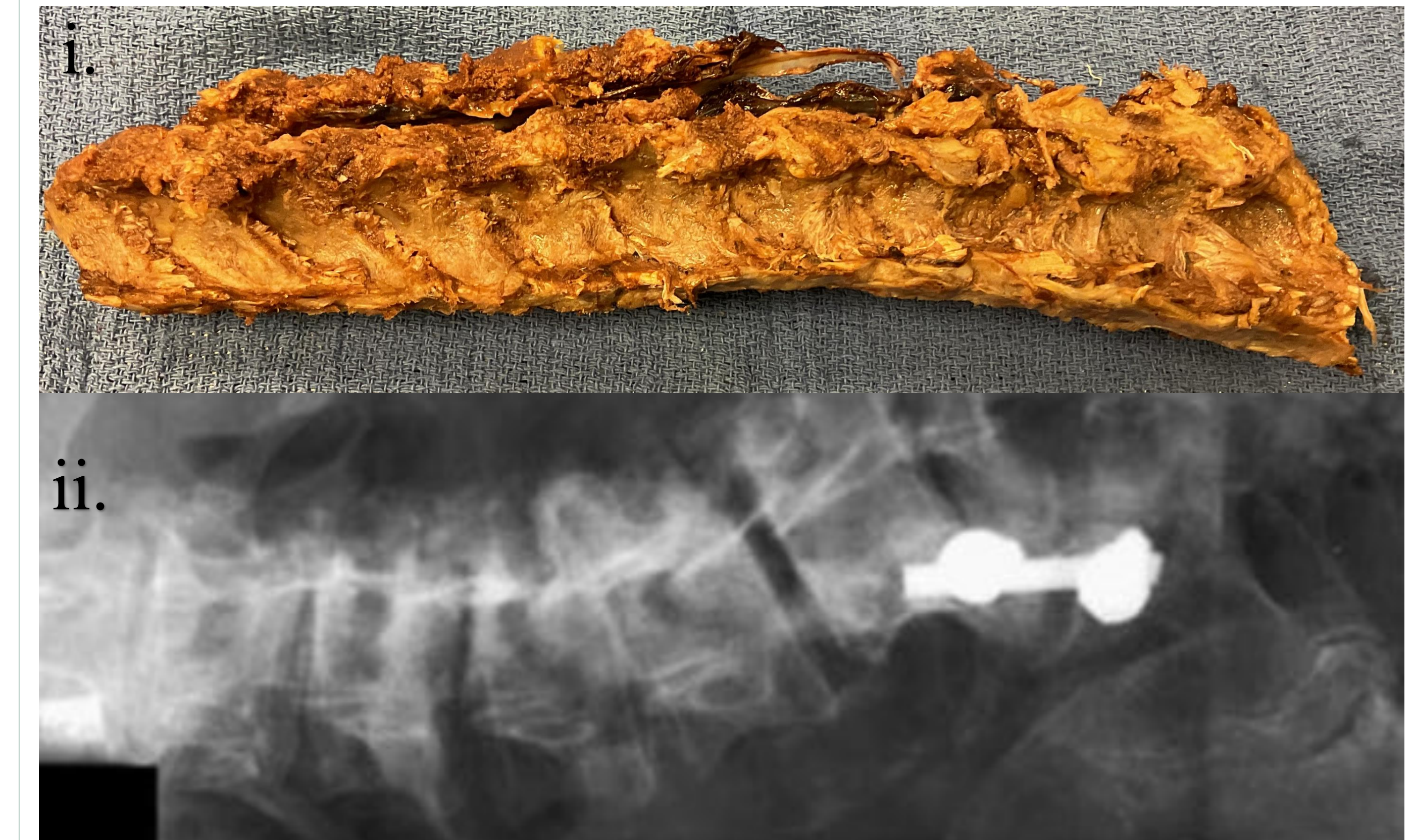
Figure 4. Vertebral Column Removed From the Body.

The vertebral column removed from the body (i). An example of a left fusion to prevent progression of the curvature (ii) 4