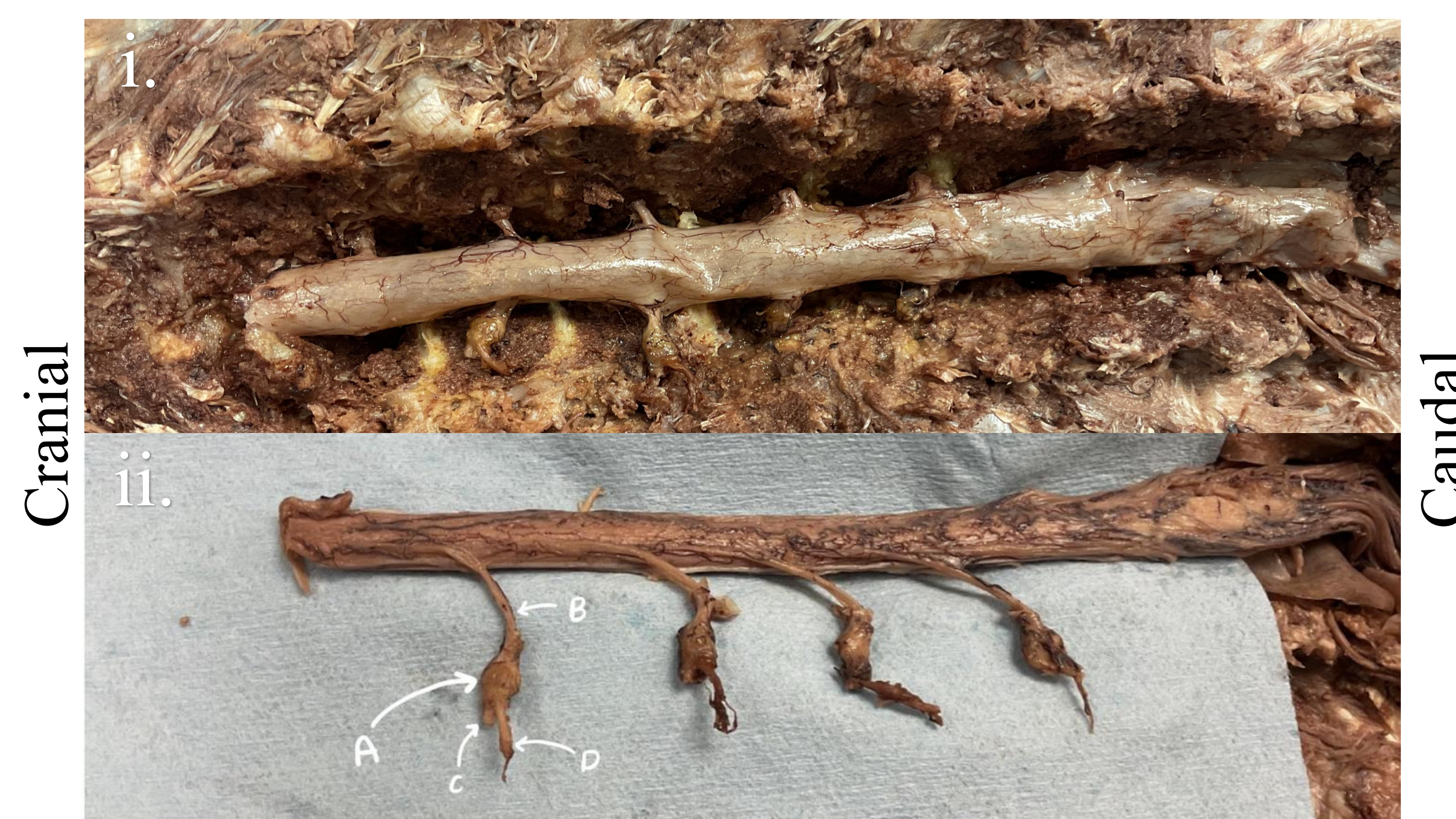
Figure 3. Thoraco-lumbar spinal cord reveal.

i. Dura mater protecting the spinal cord. ii. The dorsal root ganglion (A) exposed revealing the dorsal and ventral roots (B), the dorsal rami (C) and the ventral rami (D).