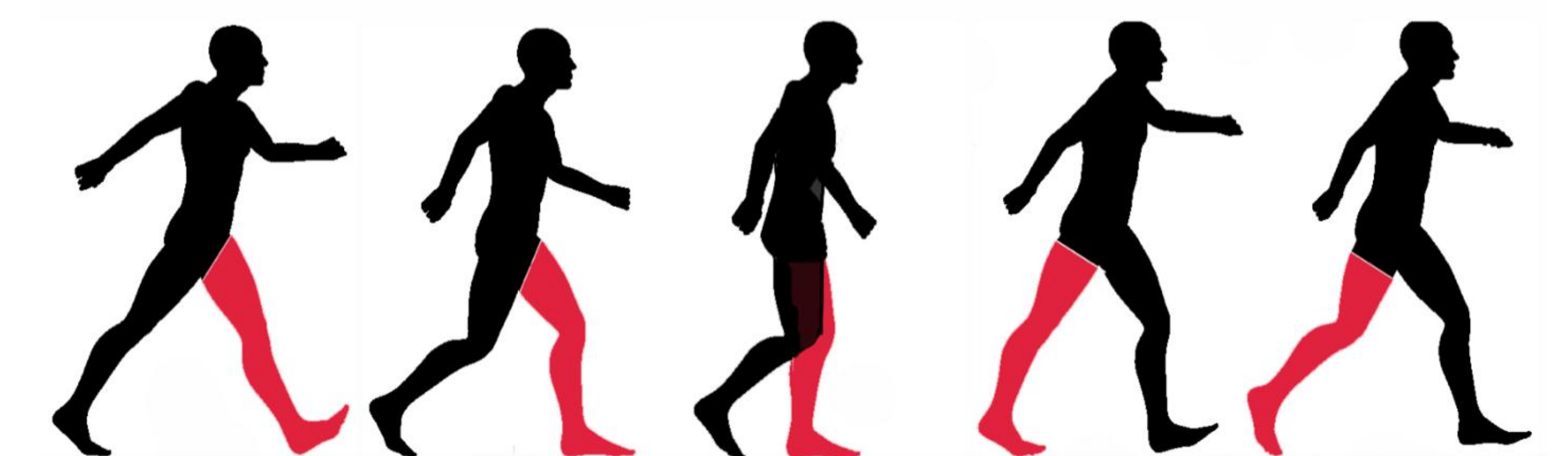
Figure 5. Phases of a Normal Gait Cycle.

The gait cycle includes two phases, the stance phase (pink: heel strike, mid-stance, toe off) and swing phase (black). 6